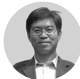
National Kaohsiung University of Science and Technology

I have been quite satisfied with Omniscriptum's publication processes. The process has been largely under my personal control. The fact that authors retain their copyrights is a practical approach to modern publishing. It allows authors complete flexibility in the open-source dissemination of their own works while providing global access to their research.