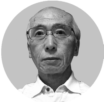
a member of The Institute of Electronics, Information and Communication Engineers, Japan