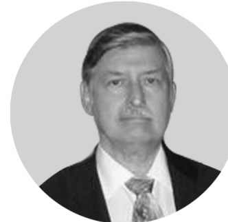
PhD in Economics from Leipzig Graduate School of Management

I thank for giving me such a great opportunity to publish my fifth book with them. I am really so grateful. In this book I propose fully homomorphic public-key encryption (FHPKE) with the recursive ciphertext. A ciphertext consists of three sub-ciphertexts corresponding to one plaintext.