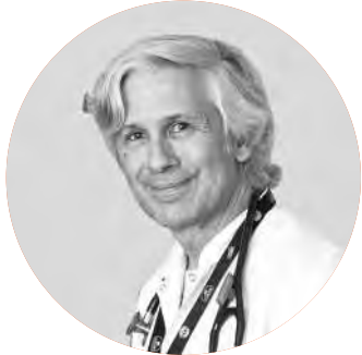
doctor of Medicine at the University of Buenos Aires