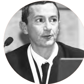
professor at the Polytechnic University of Catalonia

I am pleased to share with you my experience with OmniScriptum and the publication of my book Vivencia de Fe. From the beginning, the proposal they made to me was versatile and personalized, taking into account my suggestions in the context of a fluid cooperation and in very professional manner. The work method is simple and adapted to the author- being able to find simple and direct indications to facilitate a quick edition of my book. I found the marketing offers attractive. The fact the book appeared on Amazon was also important.