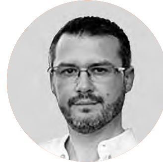
has been director of the School of Theology of Écija and director of the International Journal Isidorianum

The publication process of my book was very fast and I was very happy. I decided to publish with EAE because I am very satisfied with a previous publication.