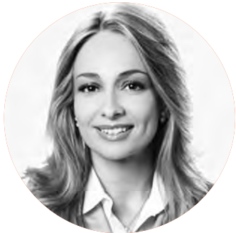
researcher, the University of Cambridge

Attentive and flexible, editors give a response in a real time, always looking for options and solutions. They are a true paradigm in a world, where reality is complex and tasks are full of obstacles and limitations. There are few people willing to help. I should emphasize I am an author from a country labeled as "emerging" with economic issues and with difficult access to publish in a high impact English-language journals. In my case this opportunity has been twice as valuable.