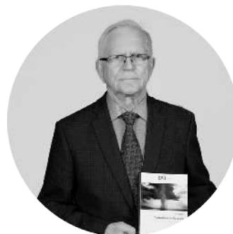
Former Prime Minister of Estonia

European University Publishing approached me after seeing an article published as part of an educational project on e-learning... They pay serious attention to the content. No publication blindly! The financial and copyright conditions of Éditions Universitaires Européennes are very fair. It was a real pleasure to work with them, and I will probably come back to education issues!