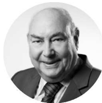
Director of Business Studies at Robert Kennedy College, Switzerland

The publication experience of our work at OmniScriptum is satisfactory for more than one reason: besides print quality and the speed of taking charge of the requests, the author benefits from an personalized approached during all stages of publication. I admit that I was particularly sensitive to the effectiveness of the OmniScriptum team.