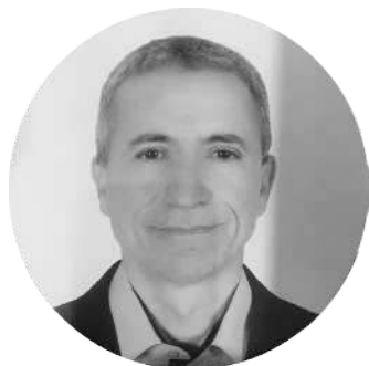
Professor at Hassan II University, Morocco

I confess that initially I did not feel reassured to work, from a distance, with people who will have the responsibility of editing my book when I had never met them before. Finally, your accompaniment has been effective and of high human quality. I really appreciated your professionalism. I can only recommend to other authors to discover the modern publishing house OmniScriptum.