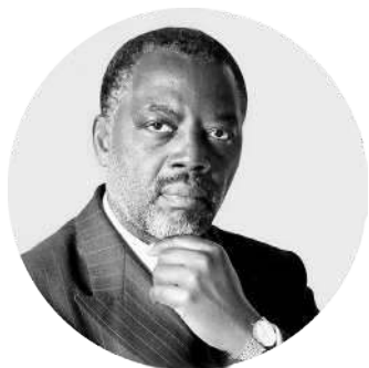
Honorary Minister of Tourism and Consultant, Democratic Republic of Congo