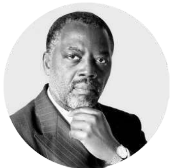
Honorary Minister of Tourism and Consultant, Democratic Republic of Congo