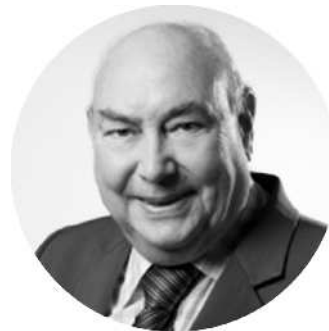
Director of Business Studies at Robert Kennedy College, Switzerland

The publication experience of our work at OmniScriptum is satisfactory for more than one reason: besides print quality and the speed of taking charge of the requests, the author benefits from an personalized approached during all stages of publication. I admit that I was particularly sensitive to the effectiveness of the OmniScriptum team.